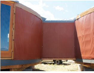
INSULATED MATCHING HALLWAY