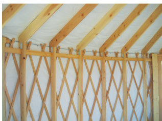
SNOW AND WIND KIT TAILORED TO MEET YOUR ENVIRONMENTAL NEEDS