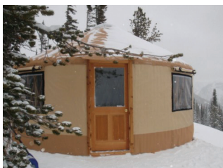
ADD AESTHETIC PROTECTION WITH OUR BOTTOM BAND OPTION