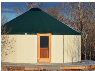
SINGLE DOOR, SHOWN WITH SOLID WOOD OPTION AND SCREEN DOOR

WE'RE HERE TO HELP! CONTACT US IF YOU HAVE ANY QUESTIONS ABOUT OUR CUSTOM OPTIONS.