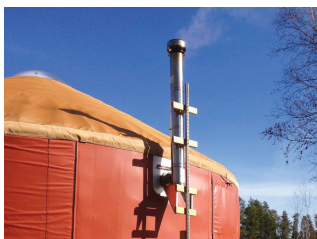
WE CAN BUILD CUSTOM FLASHING FOR ANY VENTILATION/HEATING SYSTEM