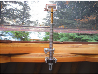
DOME OPENER FOR VENTILATION

GIVE US A CALL TO DISCUSS WHAT OPTIONS WILL BEST SUIT YOUR INDIVIDUAL YURT NEEDS.