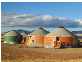
LONG LASTING FABRICS STAND UP AGAINST WIND AND WEATHER