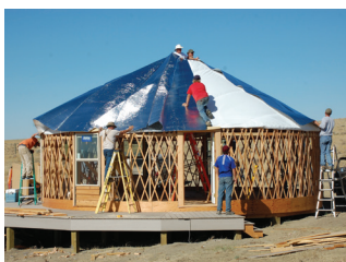
INSULATION OFFERED: STANDARD AND ARCTIC