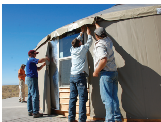
EASY TO INSTALL, REPLACE AND REPAIR